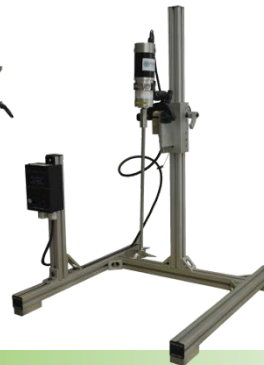
MOD MIXER WITH STAND