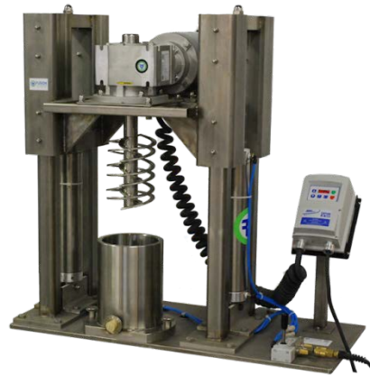
FLOW SERIES HIGH VISCOSITY LAB MIXER