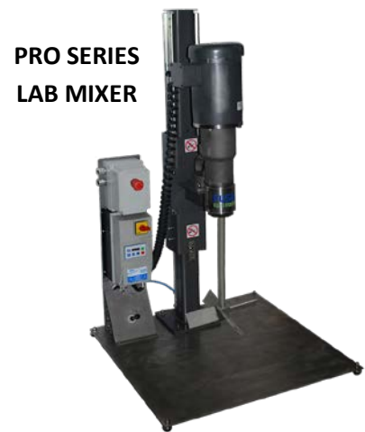
PRO SERIES LAB MIXER

Fusion is pleased to offer lab mixing solutions for specific application needs. When you require specialized equipment that can't be found in catalogs or from off-the-shelf suppliers, let's work together! Each project is viewed as unique, is given the attention it deserves, and is designed in a creative and knowledgeable manner. With our application and design expertise, extensive network of suppliers, 3D modeling, and custom fabrication capabilities, Fusion is well-equipped to provide unique solutions for your lab mixing process.