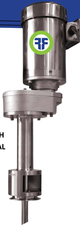
GEAR DRIVE WITH MECHANICAL SEAL