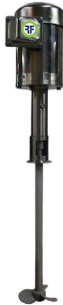
DIRECT DRIVE WITH FDA LIPSEAL