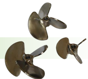
See Pg. 19 for Sanitary Impeller Details.