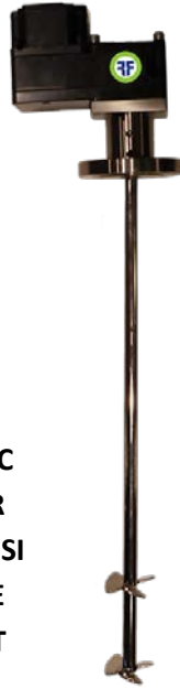
ELECTRIC MOTOR WITH ANSI FLANGE MOUNT