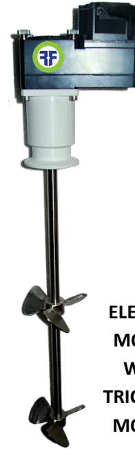
ELECTRIC MOTOR WITH TRICLAMP MOUNT