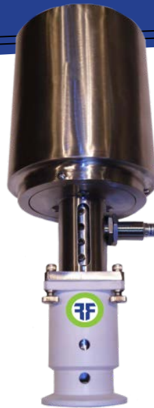
PNEUMATIC MOTOR WITH TRICLAMP MOUNT